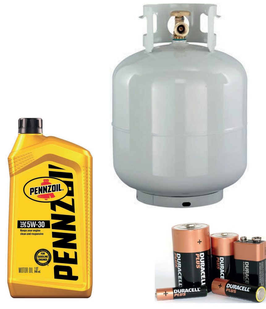
Toxic Product Containers Batteries