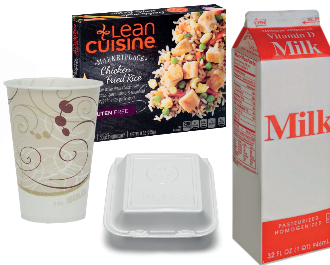
Waxed Paper Products Styrofoam