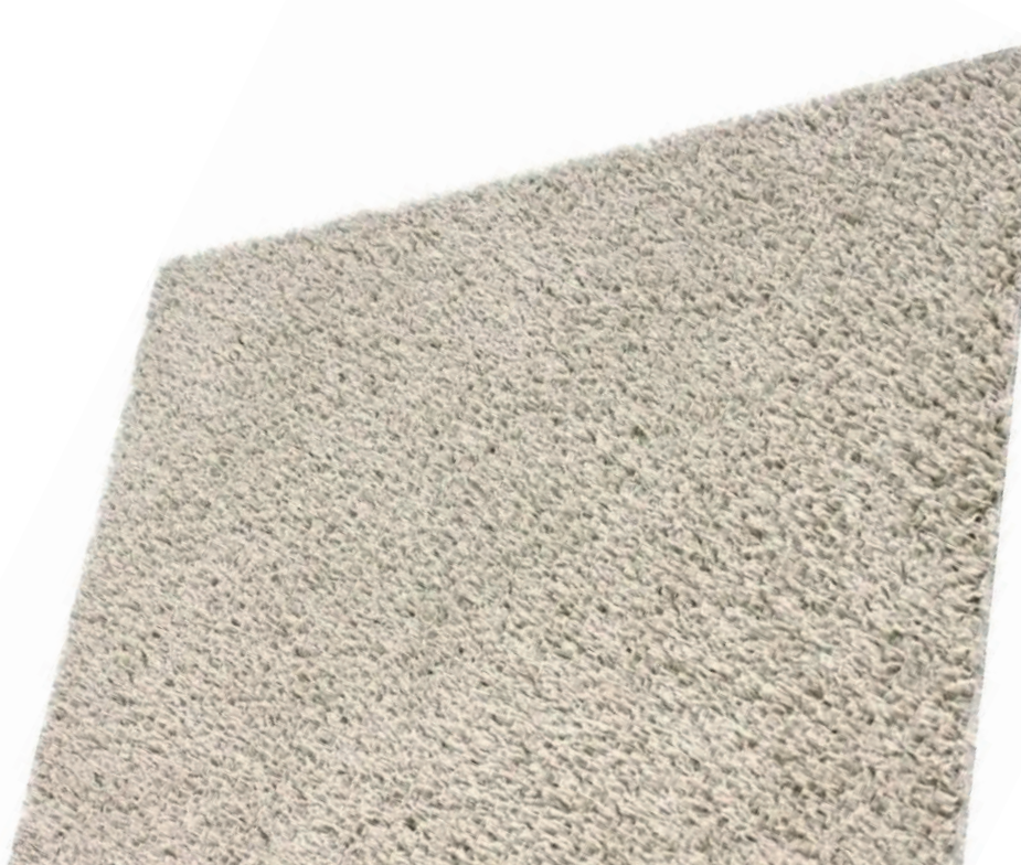
Carpet Furniture Mattresses