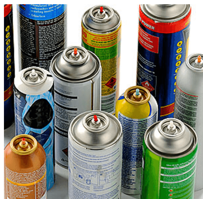
Aerosol Spray Cans