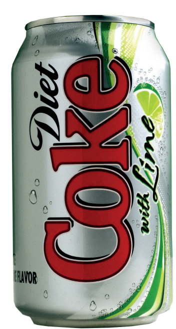
Aluminum Beverage Cans