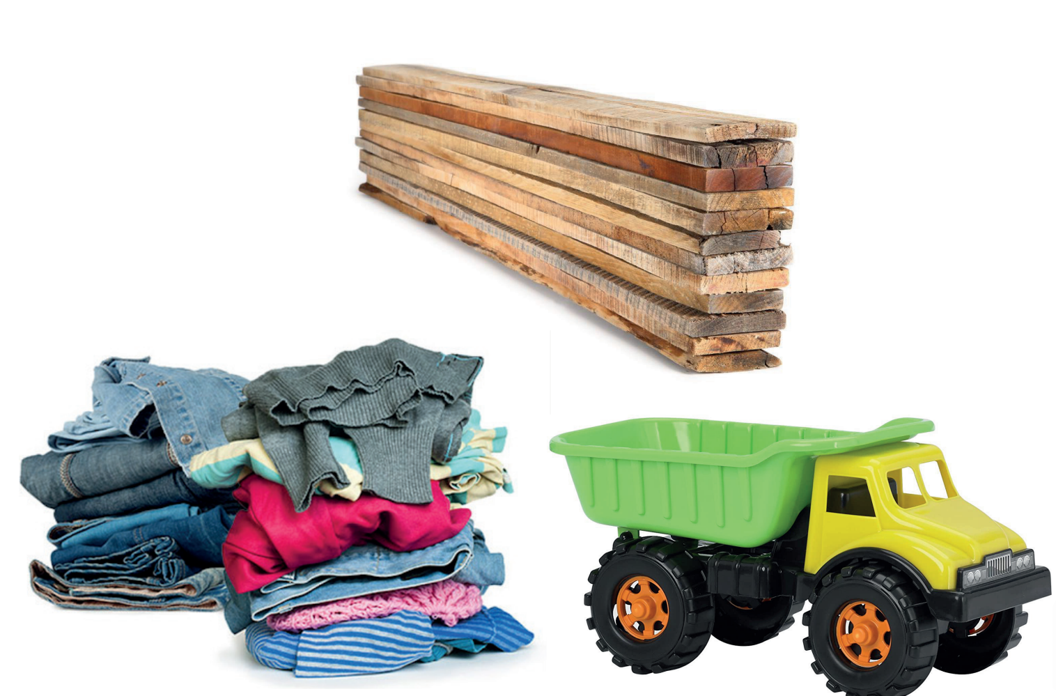
Wood Clothes & Fabrics Plastic Toys