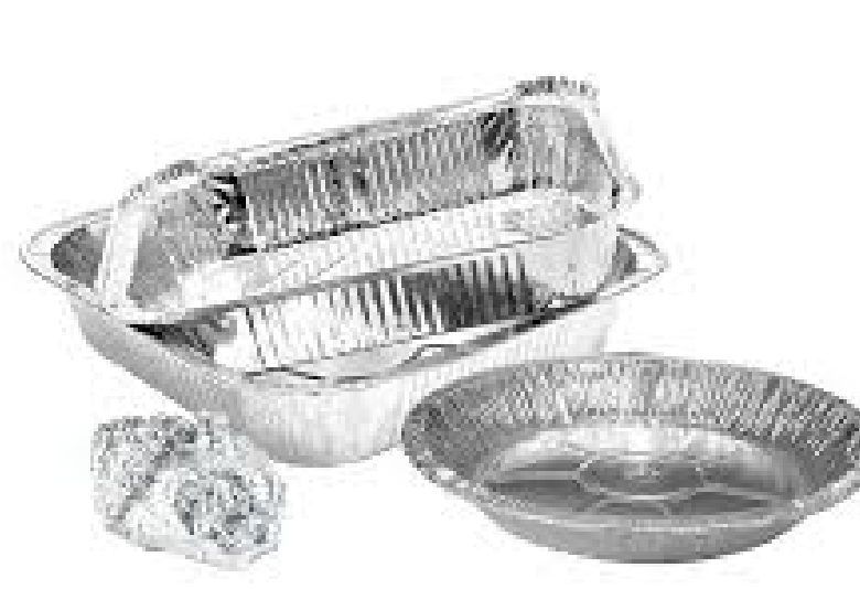
Aluminum Foil and Trays

Preparation: • Empty and rinse cans and trays to remove all residue. • Remove all paper and plastic labels.