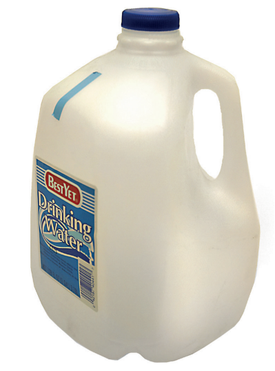
Plastic Jugs used for Milk, Juice, Soap and Soft Drinks