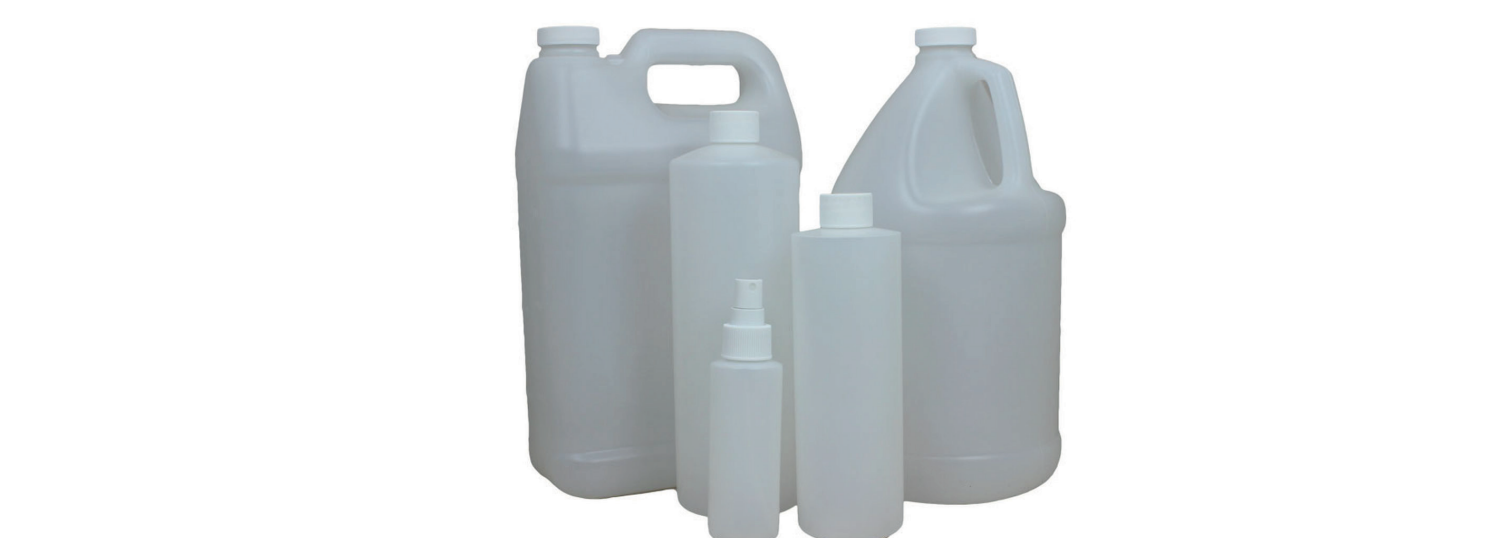
Plastic Household Cleaning Containers (Bottles/Jugs)