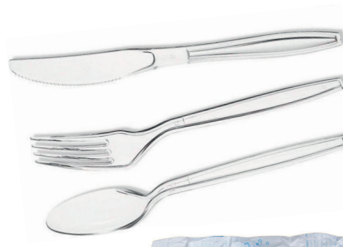
Plastic Bags Plastic Utensils Diapers

Dumping waste, such as discarded trash, oil, appliances, scrap tires, furniture and other items, on private or public land and waterways is strictly prohibited by Ohio law. In addition to being unsightly, illegal dumps can pose health and safety hazards to people and wildlife. Ohioans must use licensed disposal facilities and insist that contracted waste haulers dispose of trash safely and legally.